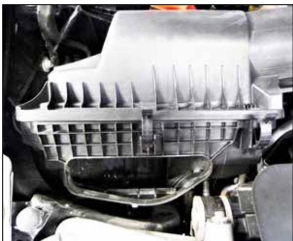
8. Release the three clips that secure the air filter lid and then remove the lid and factory air filter.