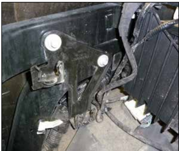
10. Remove the two bolts that secure the air filter housing mounting bracket to the inner fender and then remove the bracket from the vehicle.