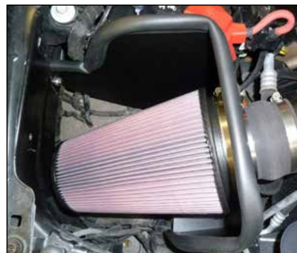
20. Install the K&N air filter onto the filter adapter and secure with the provided hose clamp.