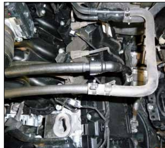
19. Connect the factory vent hoses to the hoses and fittings attached to the K&N intake tube.