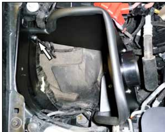
14. Install the heat shield so the mounting stud inserts into the mounting grommet and then secure to the inner fender with the provided hardware.