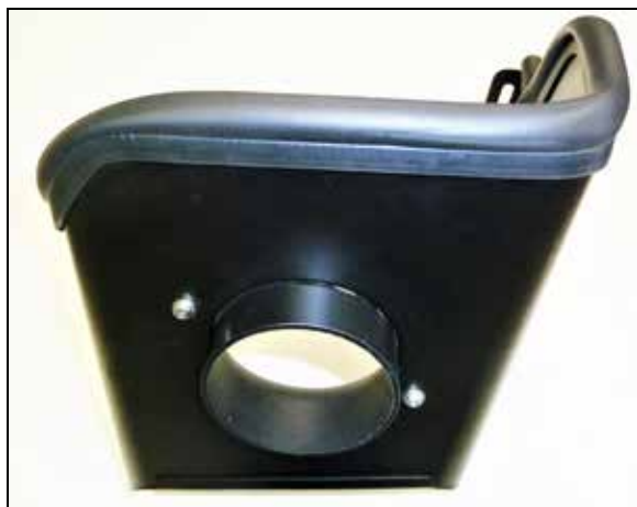
12. Install the filter adapter into the heat shield and secure with the provided hardware.