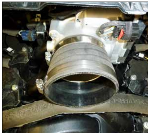
16. Install the straight coupler onto the throttle body and secure with the provided hose clamp.