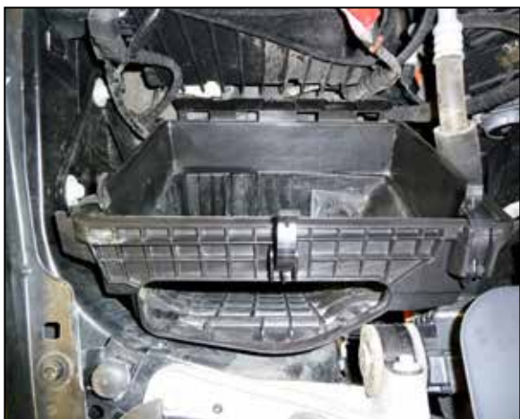
9. Pull the lower air filter housing up to dislodge it from the mounting grommets and then remove it from the vehicle.