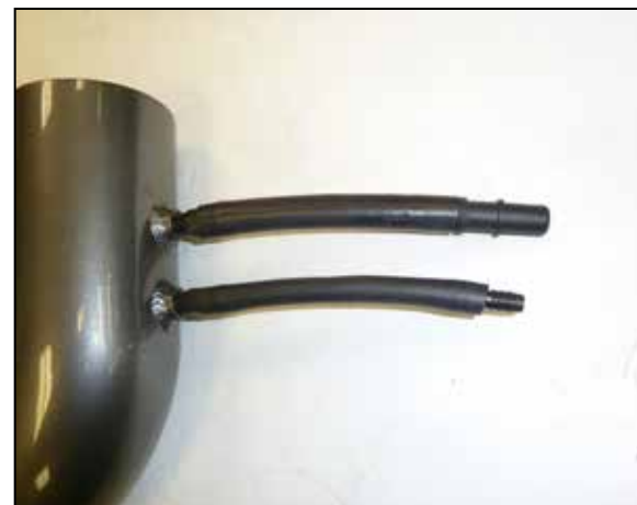
17. Install the provided vent hoses and fittings onto the K&N intake tube as shown.