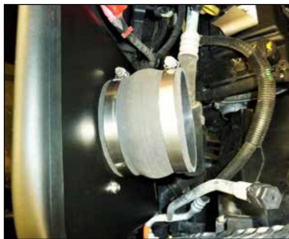
15. Install the provided hump coupler onto the filter adapter and secure with the provided hose clamp.