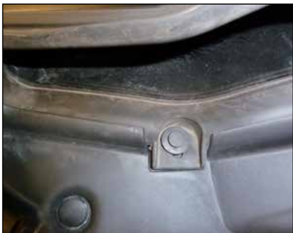
7. Remove the push-pin that secures the fresh air duct and then remove the fresh air duct from the vehicle.