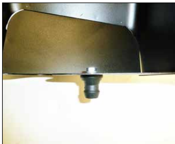
13. Install the mounting post onto the heat shield using the provided hardware.