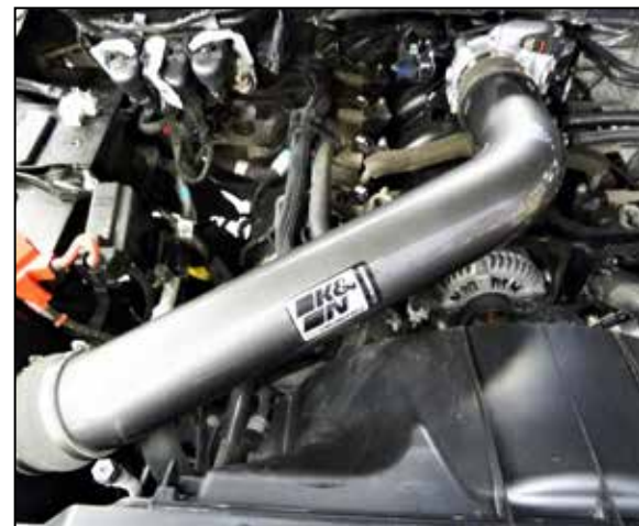
18. Install the K&N intake tube into the hump coupler and then into the straight coupler, adjust for best fit and then secure with the provided hose clamps.