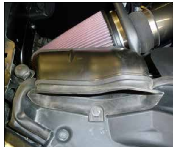
21. Reinstall the fresh air duct and secure with the factory push pin.